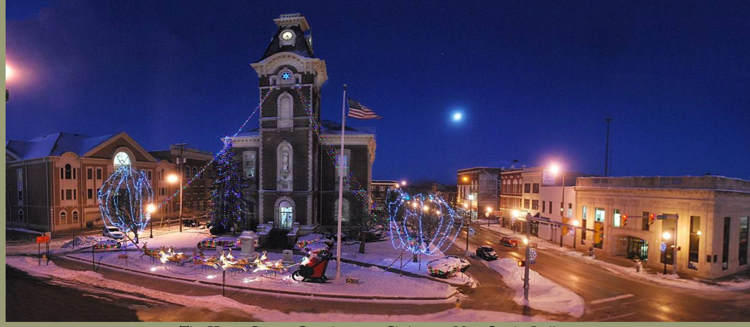
The Henry County Courthouse at Christmas, New Castle, Indiana.