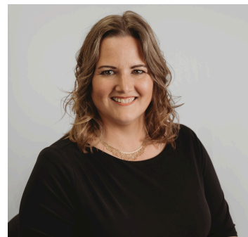
President and Executive Director